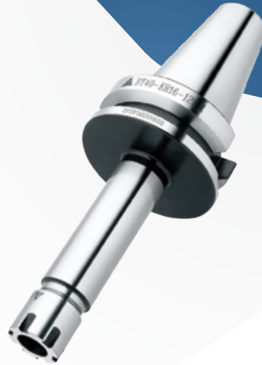
Dimensions / 尺寸標示