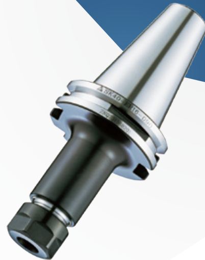
Dimensions / 尺寸標示