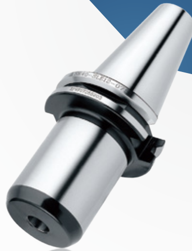
Dimensions / 尺寸標示