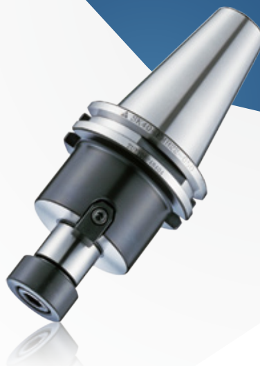
Dimensions / 尺寸標示