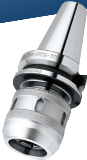
Dimensions / 尺寸標示