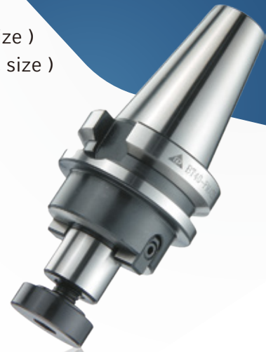
Dimensions / 尺寸標示