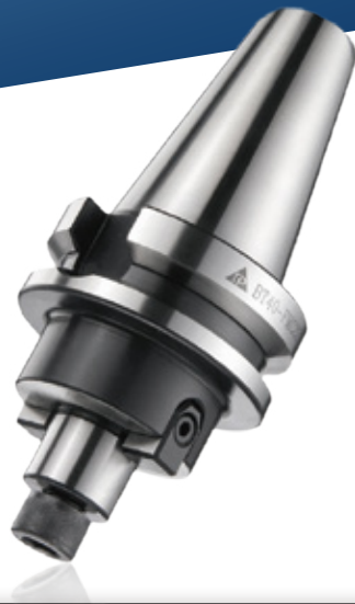
Dimensions / 尺寸標示