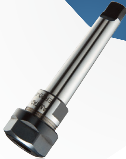
Dimensions / 尺寸標示